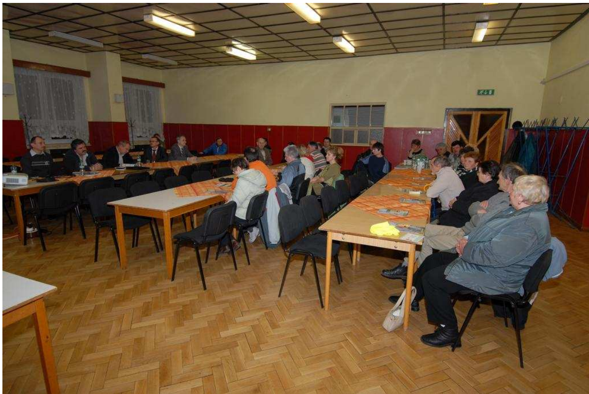
Fig. no. 3: Presentation of NRR Enlargement in Nový Tekov on 16 th March, 2011

The meetings were attended by the mayors of the municipalities (except for the municipality of Čifáre) and by the citizens interested in the activities being prepared by JAVYS to be implemented in the area in question.