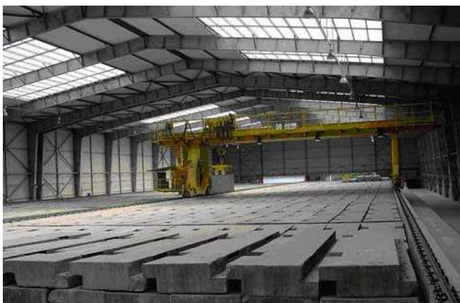
Fig. no. 1: First degree of barriers in double-row in operation

Repository started routine operation in 2001 and since then, it has been in continuous operation. At present, only about 20 % of the repository site is used for disposal purposes. The first double row is already in use (70% filled) and the second is being prepared for starting accepting typical operational RAW from operational NPPs in Slovakia.