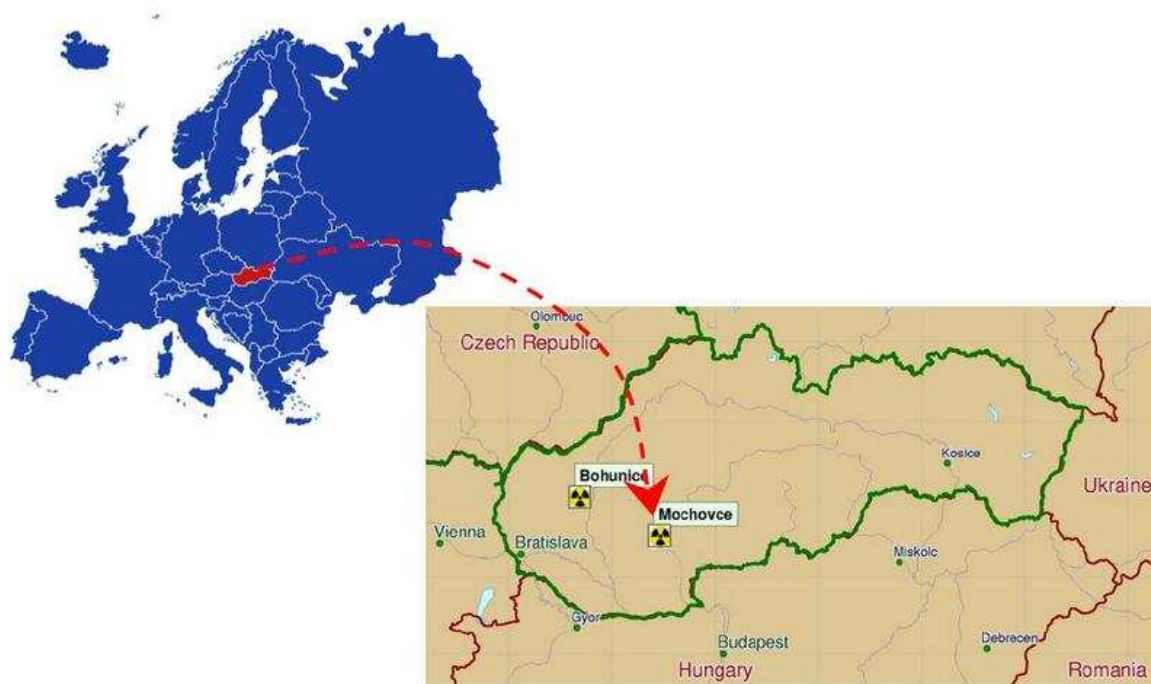
Fig. no. 2: Geographical location of the NRR.

Geographically, the NRR Mochovce territory belongs to the northernmost part of the Hronská pahorkatina (hills) – geomorphological subdivision of the Bešianska pahorkatina (hills). Geographical co-ordinates of the repository are: 18° 26' 11" eastern longitude, 48° 16' 18" northern latitude.